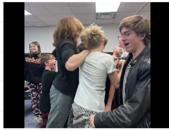
Friends are the best - celebrating a friend's win at RPS!