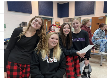
7th grade fun!