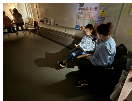
5 th Graders