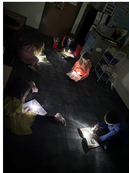
1 st Graders